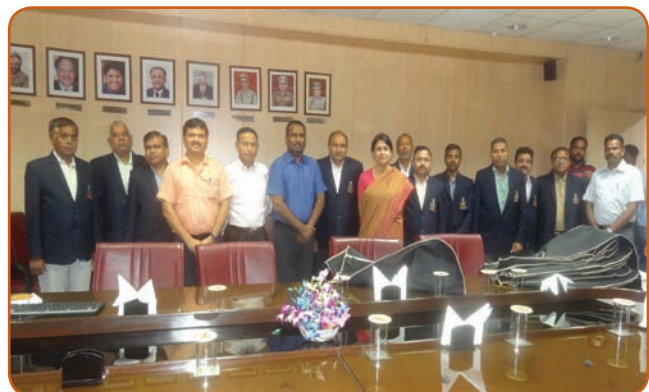
DG, BPR&D distributing the blazers to the staff of BPR&D

BPR&D provided official uniform (Blazer) to all staff from Welfare Grant.