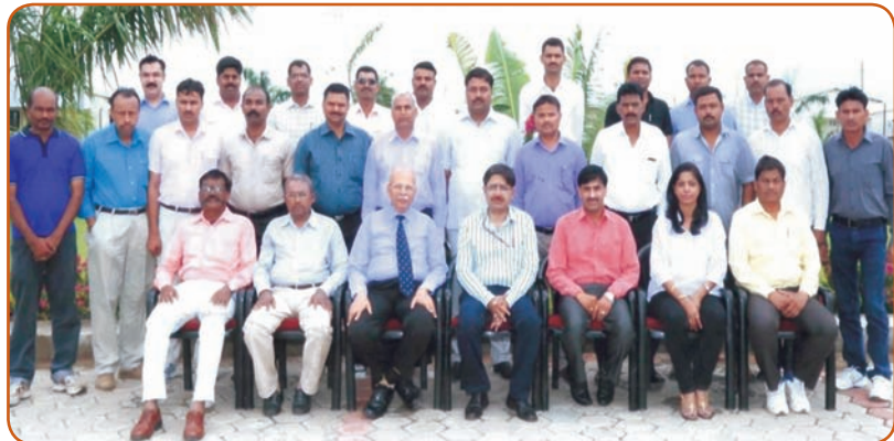
Participants and faculties of 1st Training of Trainer Refresher course conducted at Central Academy of Police Training, Bhopal from June 27 –July 1, 2016.

1 st Training of Trainer (TOT) Refresher course on Innovative Learning Environment was conducted at Central Academy of Police Training (CAPT) Bhopal from June 27 –July 1, 2016. In this course 25 police officers from all over country were trained.