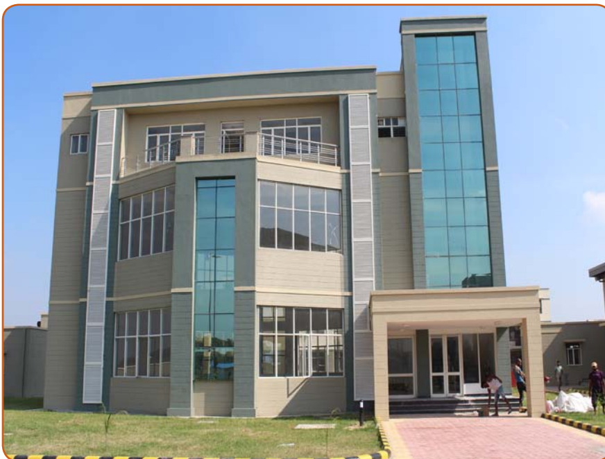
Sports Complex of the New Campus of CDTS Ghaziabad.

CDTS, Chandigarh is housed in CFI Complex, Sector 36 A, Chandigarh along with Central Forensic Science Laboratory. It has limited capacity to train 30 participants at a time. The new campus for CDTS Chandigarh with State of Art Training Infrastructure to impart training on Investigation of Cyber Crimes and other Crimes, is being developed at Sector – 88 Mohali (Punjab) in 5 acre land. This Campus is expected to be ready by the year 2019. Once this campus is ready, CDTS Chandigarh will be able to train 100 participants at a time