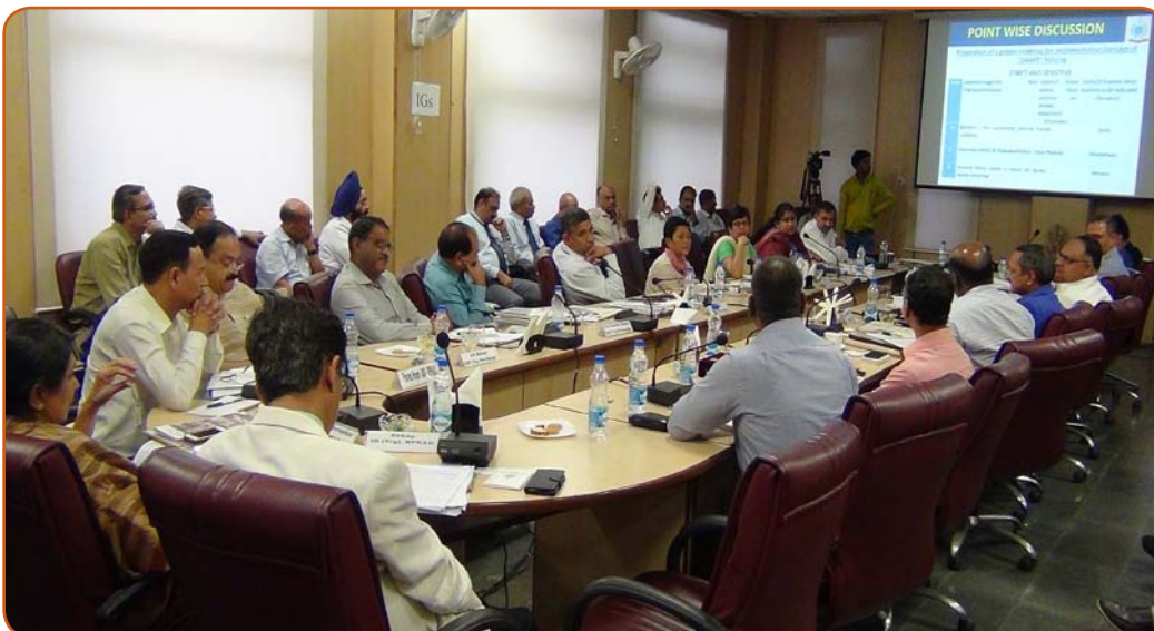
Discussion during meeting of the Nodal officers of the States/UTs on preparation of road map for implementation of 'SMART' policing concept on May 24, 2016 at BPR&D New Delhi

The Bureau intimated the delegates about circulation of the draft roadmap for implementation of concept of "SMART" Policing prepared by BPR&D, to all States/UTs for taking action and furnish feedback for making it more effective. Parameters for assessing the performance of Police Stations including guidelines have also been sent to MHA for issuing necessary direction to all concerned.