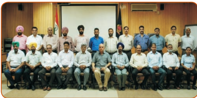
Participants and faculties of Investigation of Terrorist Crimes and Post Blast Cases course conducted at CDTS Chandigarh from May 30 –June 3, 2016.

CDTS Ghaziabad organized 11 courses during April –June, 2016 and trained 182 middle level police officers on different aspects of investigations including Cyber Crime.