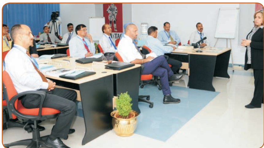
Participants during the training session in ATA course on Managing An Anti Terrorism Training Programme conducted in May-2016 at SVPNPA Hyderabad.