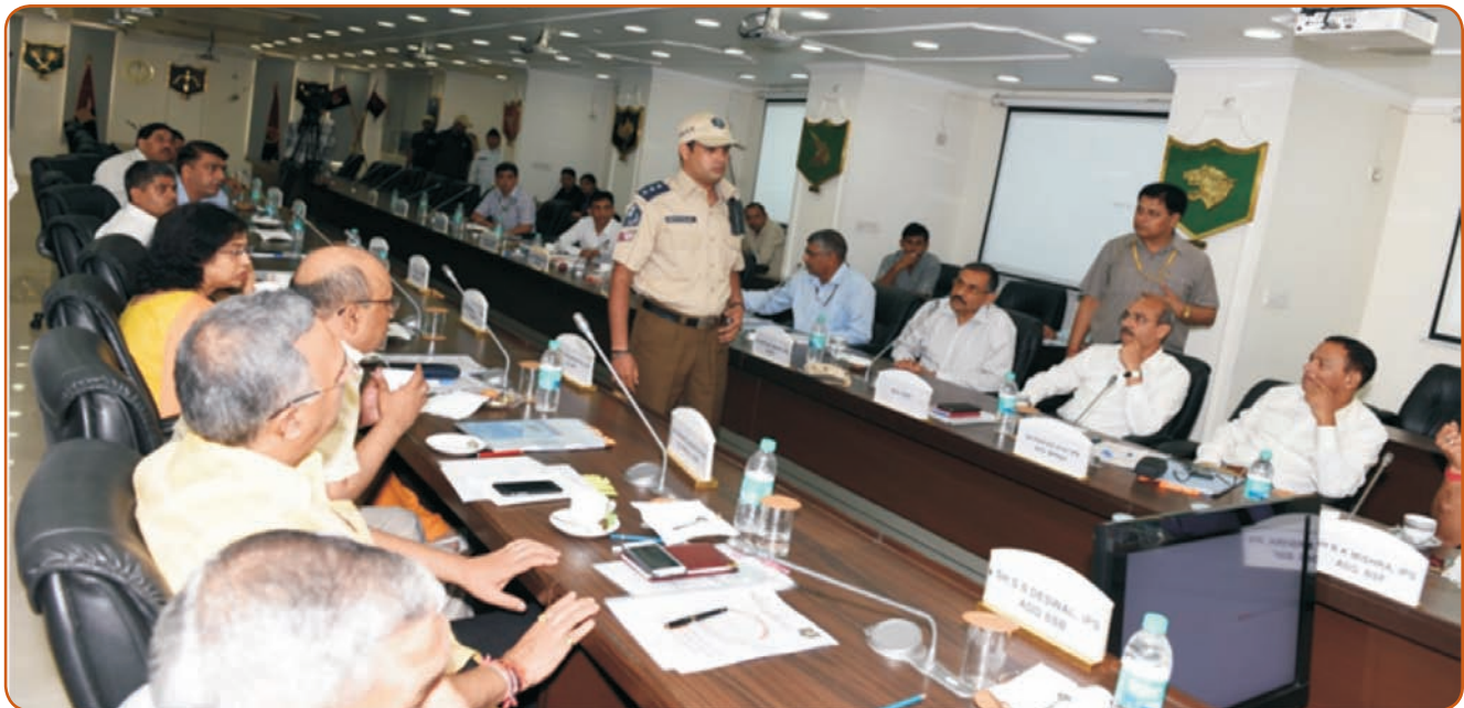
Display of the complete set of prototype uniform on June 30, 2016 at BSF HQ, New Delhi under Research Project on “SMART POLICEMEN- Developing, Designing and Trail of High Performance Uniform Articles and Accessories.