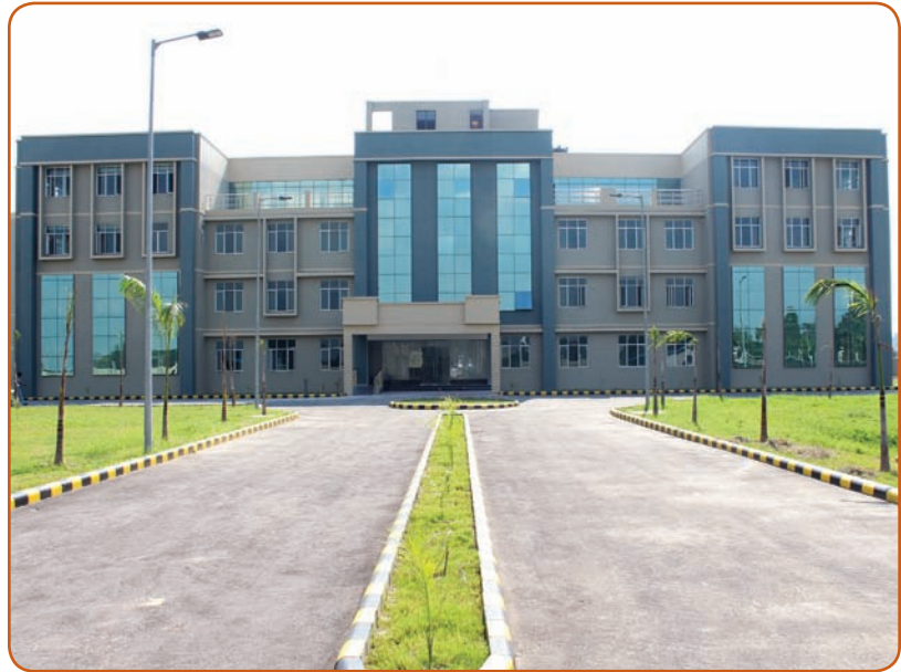
Administrative & Training Block of the New Campus of CDTS Ghaziabad.

To meet the growing requirement of training on Investigation, the new campus for CDTS Ghaziabad with State of Art Training Infrastructure, to impart training on Investigation of Cyber Crimes and other Crimes, is being developed at Sector-19, Kamla Nehru Nagar, Ghaziabad in 8.36 acres land. At present CDTS, Ghaziabad is housed in CGO-II, Complex, Ghaziabad. It has limited capacity to train 30 participants at a time. The construction of Campus is in advance stage and expected to be ready by September, 2016. Once this campus is ready, CDTS Ghaziabad will be able to train 100 officers at a time.